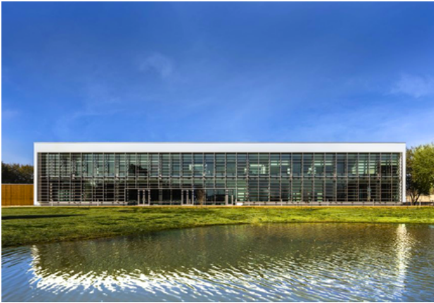
Grundfos USA Headquarters