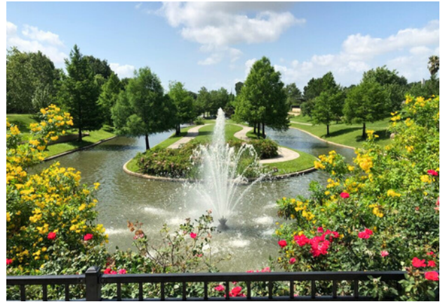
Mandolin Gardens Park

5 Stars for Sustainable Investigation, Investment, Integration, Innovation, and Inspiration