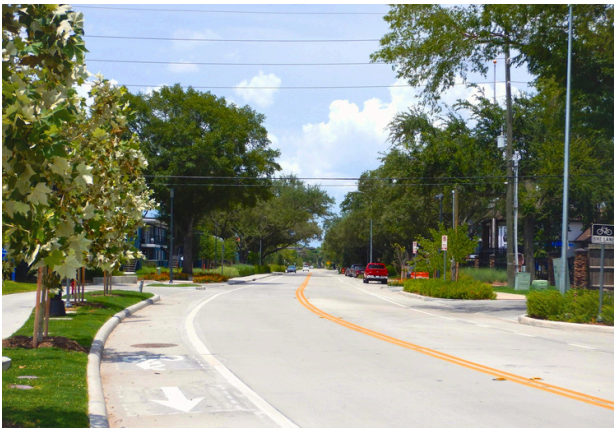
Walnut Bend Lane Reconstruction