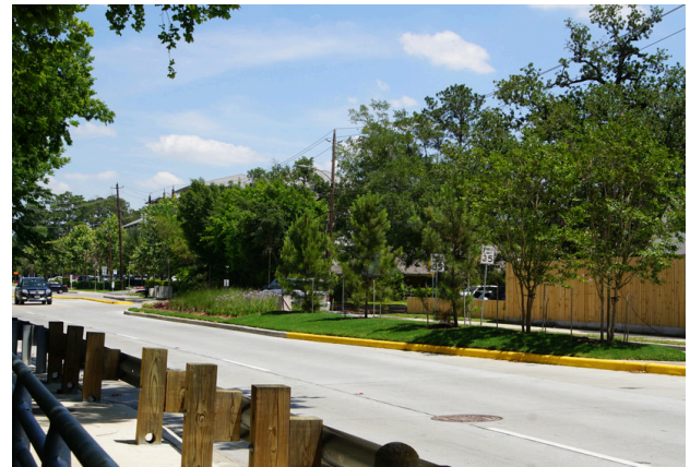
Memorial Drive Reconstruction